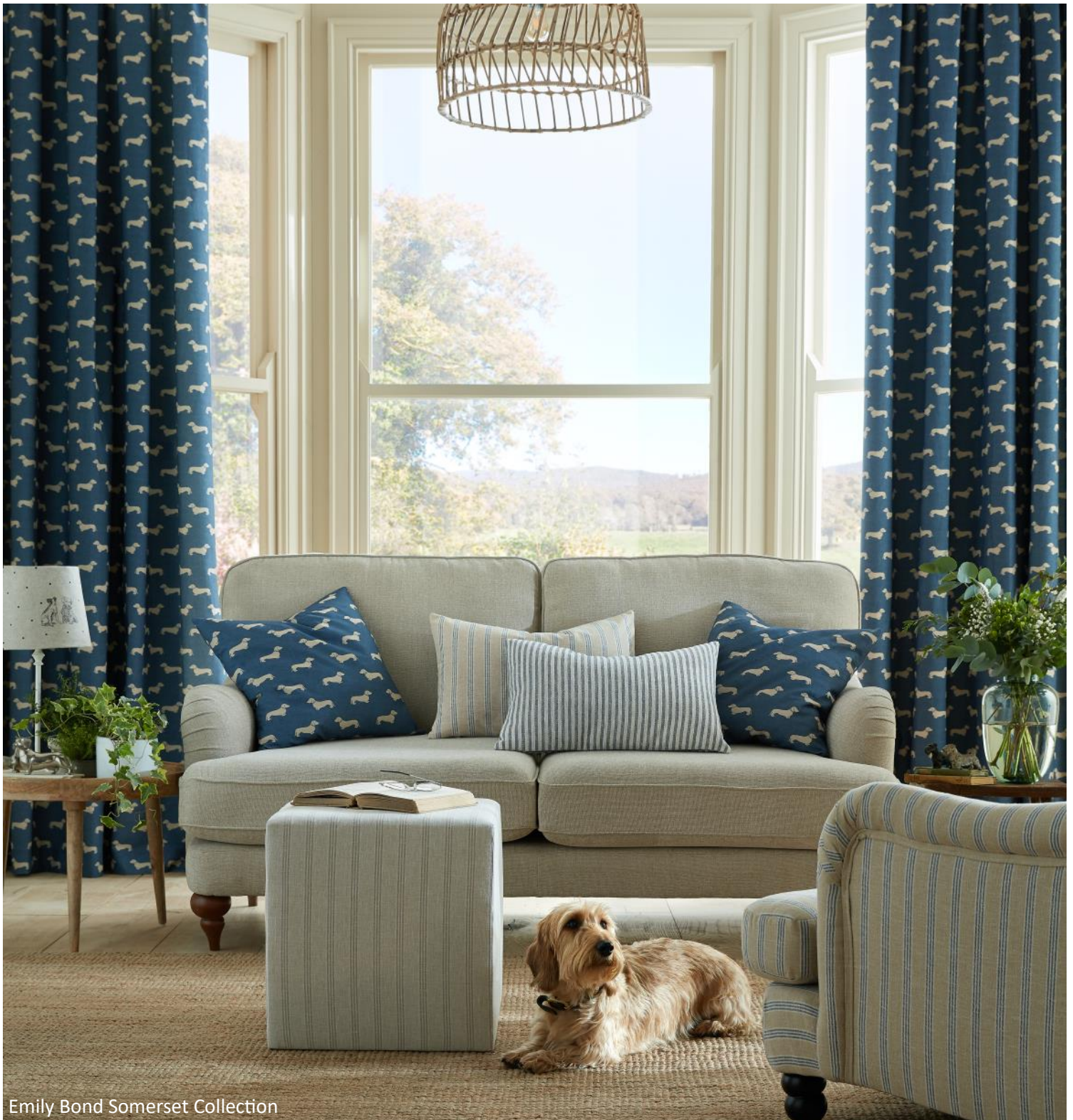
Emily Bond Somerset Collection