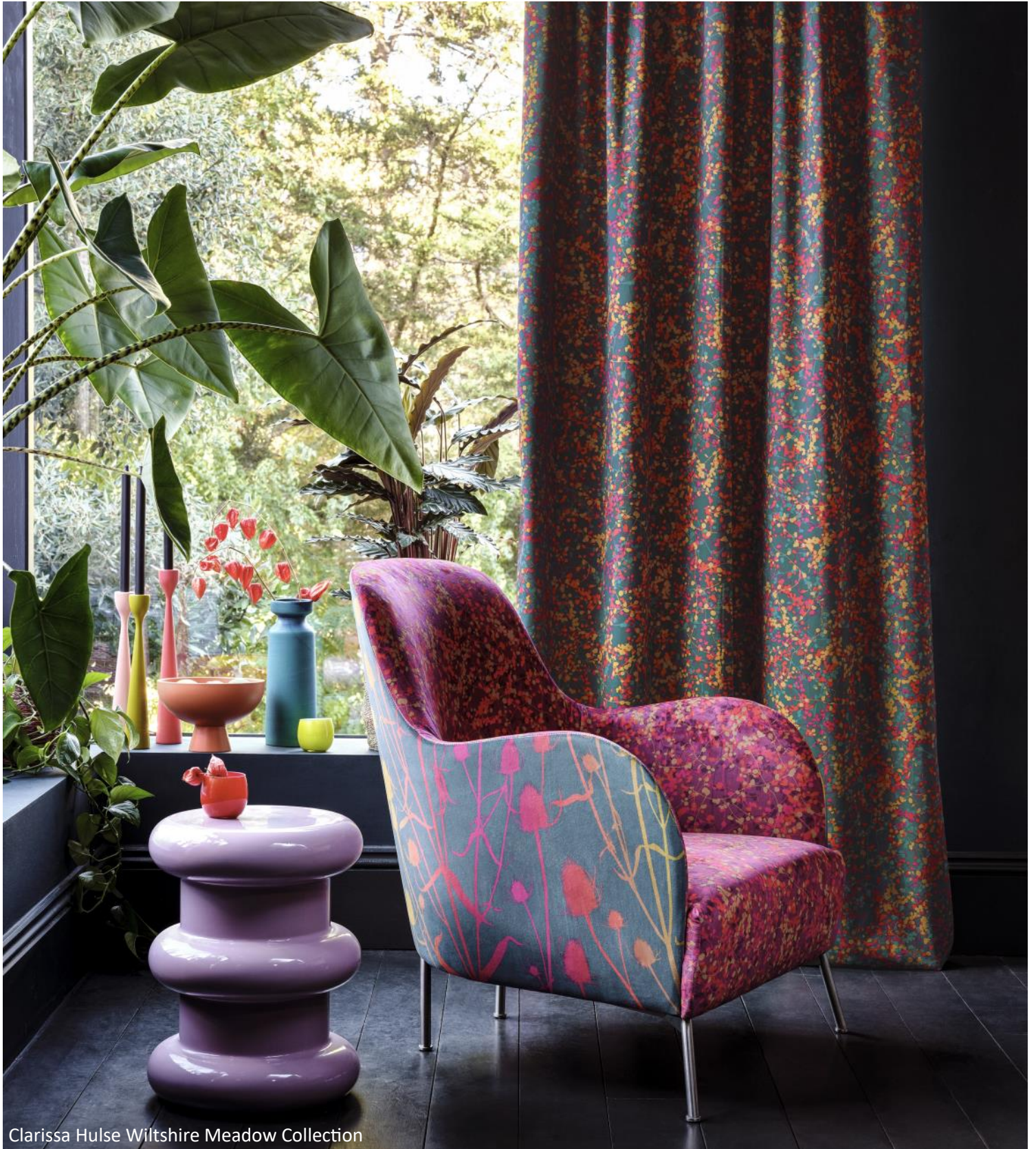
Clarissa Hulse Wiltshire Meadow Collection