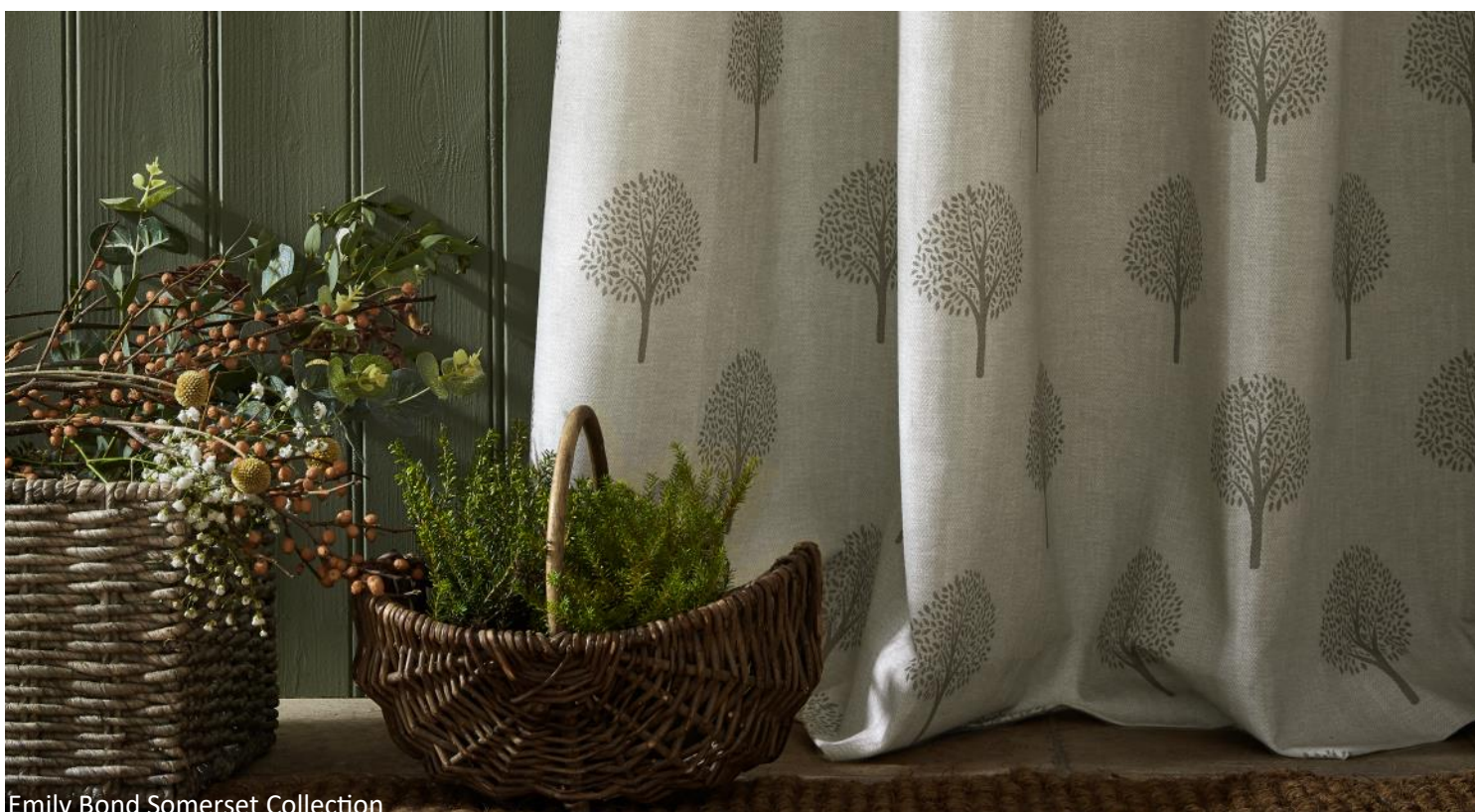
Emily Bond Somerset Collection