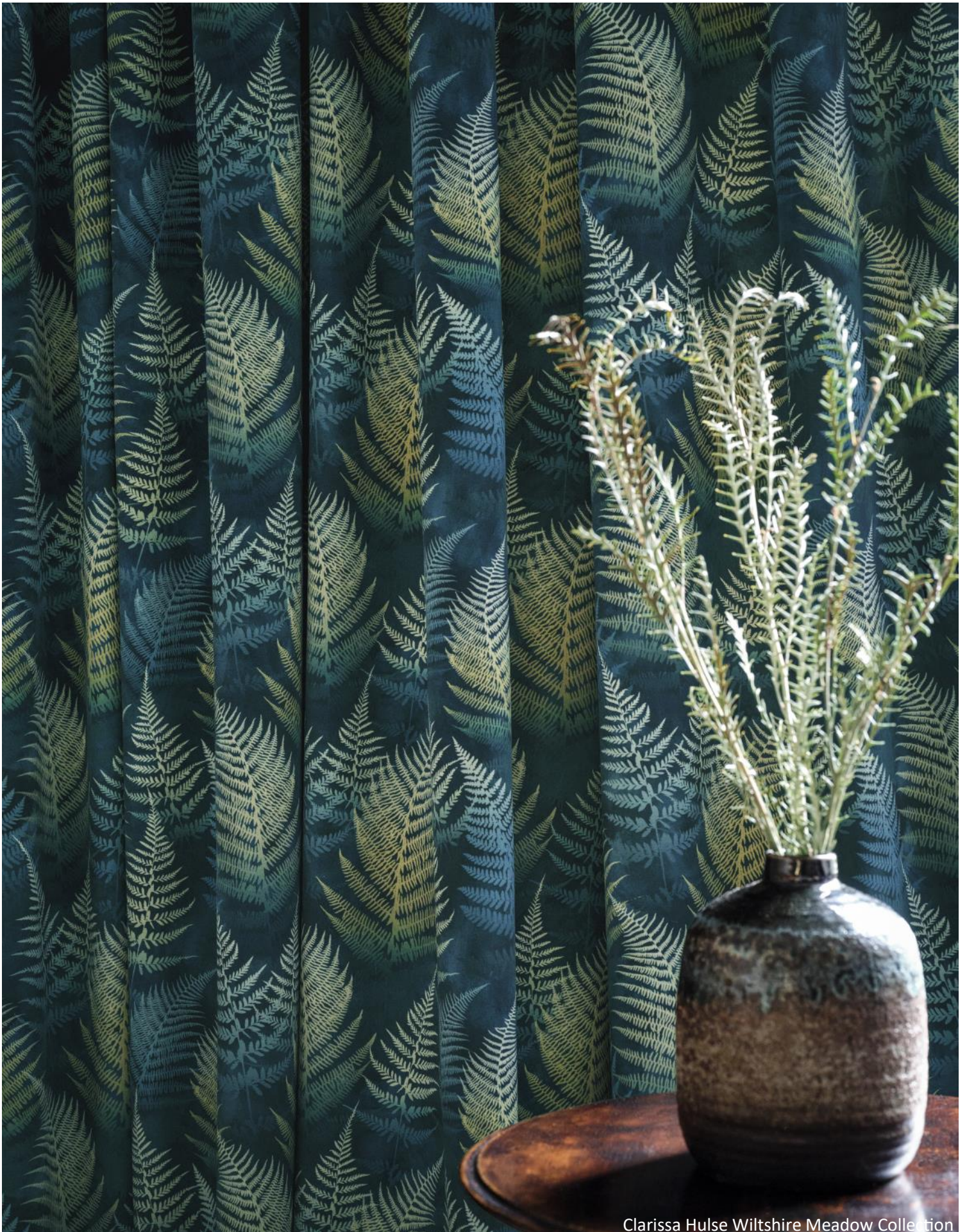
Clarissa Hulse Wiltshire Meadow Collection