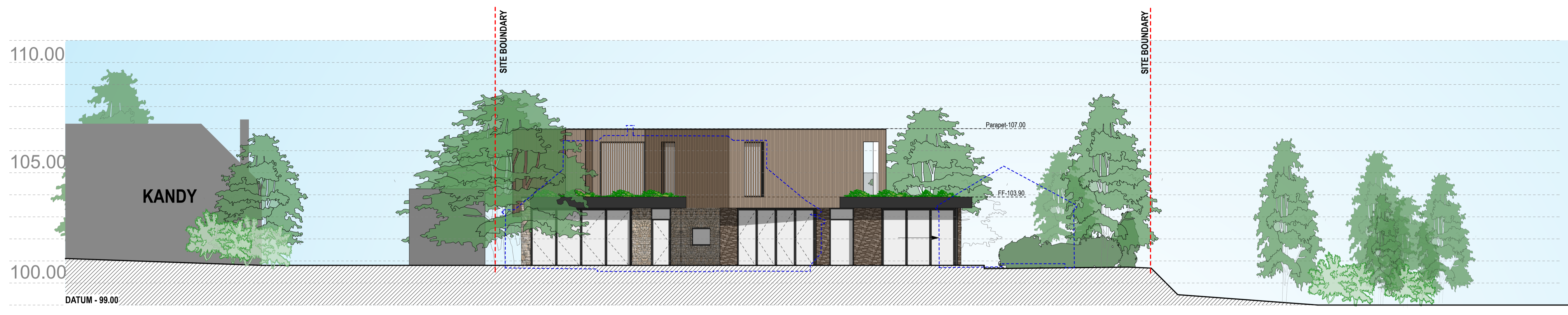
95.00 proposed west elevation