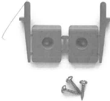
Mounting brackets (Z0Z 230)