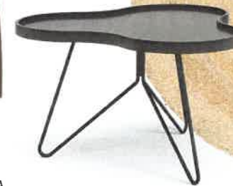
INFORMAL SEATING AREA