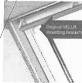
Mounting brackets (Z0Z 230)