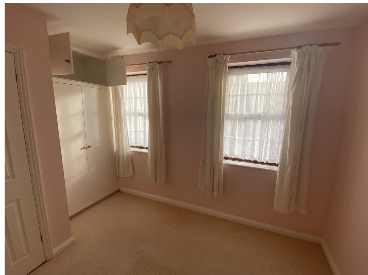
Existing Guest Bedroom - Elevation A

© Copyright Waddington Architects, Interiors & Landscape Waddington Architects, Interiors +Landscape own the copyright of this drawing and information. This drawing has been produced for the client, project and purpose as noted in the title to the right and is not intended for use by any other person or for any other purpose. This drawing is protected by copyright law and the statute of the Copyright, Designs & Patents Act 1988. All Rights Reserved. Any discrepancy between any drawings and/or documents must be notified to the architects, prior to proceeding with the work. Work to figured dimensions only, do not scale from drawings. All dimensions to be checked on site.