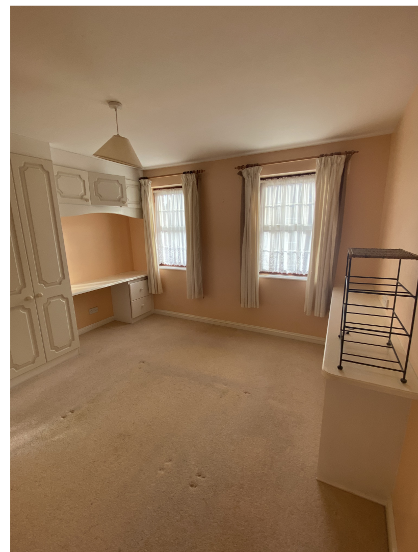
Existing Master Bed - Elevation A

11/02/2022 A PG First Issue Date No. by Revision Notes