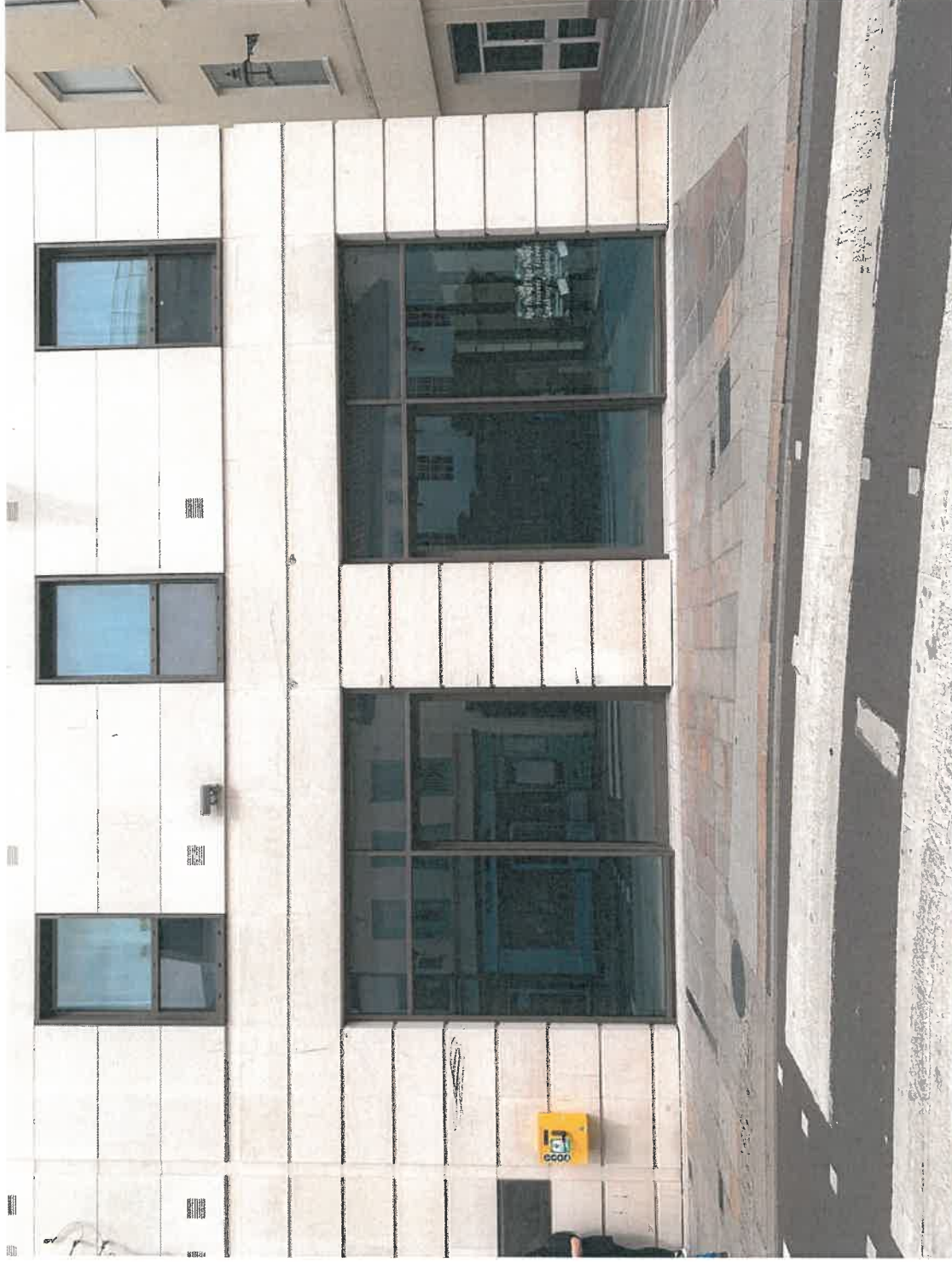
Charing Cross – South facing aspect The Front of the Building