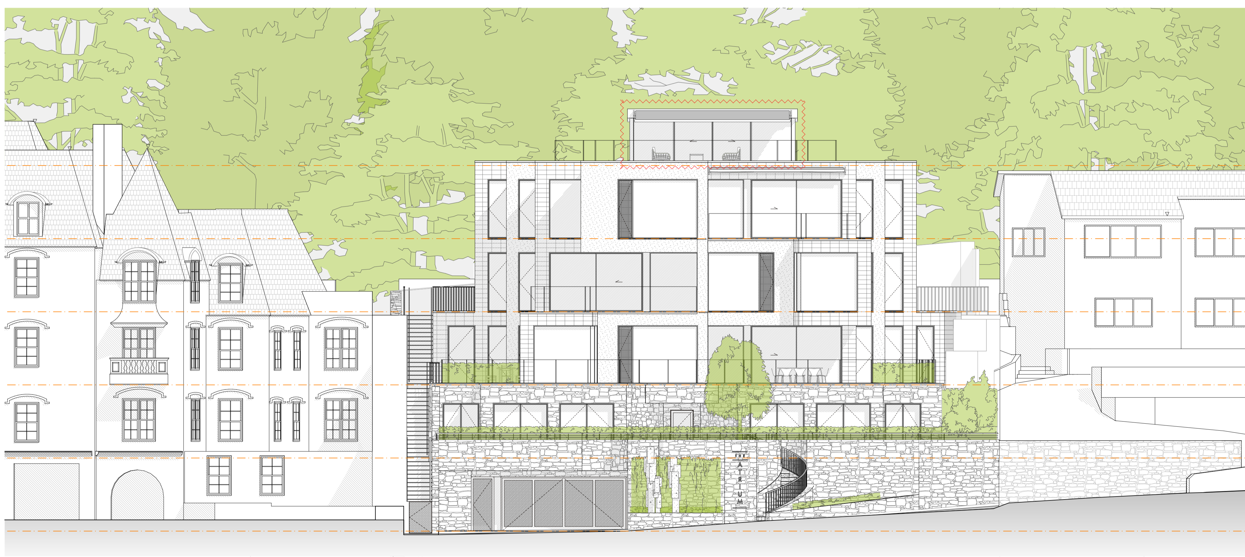
BC South Proposed South Elevation 1:100