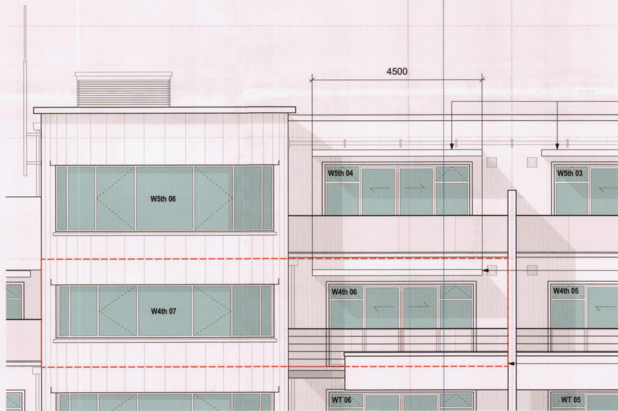
FRONT ELEVATION (SOUTH) OF PROPOSED AWNING ON APARTMENT NO.17

PREVIOUSLY APPROVED AWNING ON NEIGHBOURING APARTMENTS APPLICATION REF. P/2011/0577