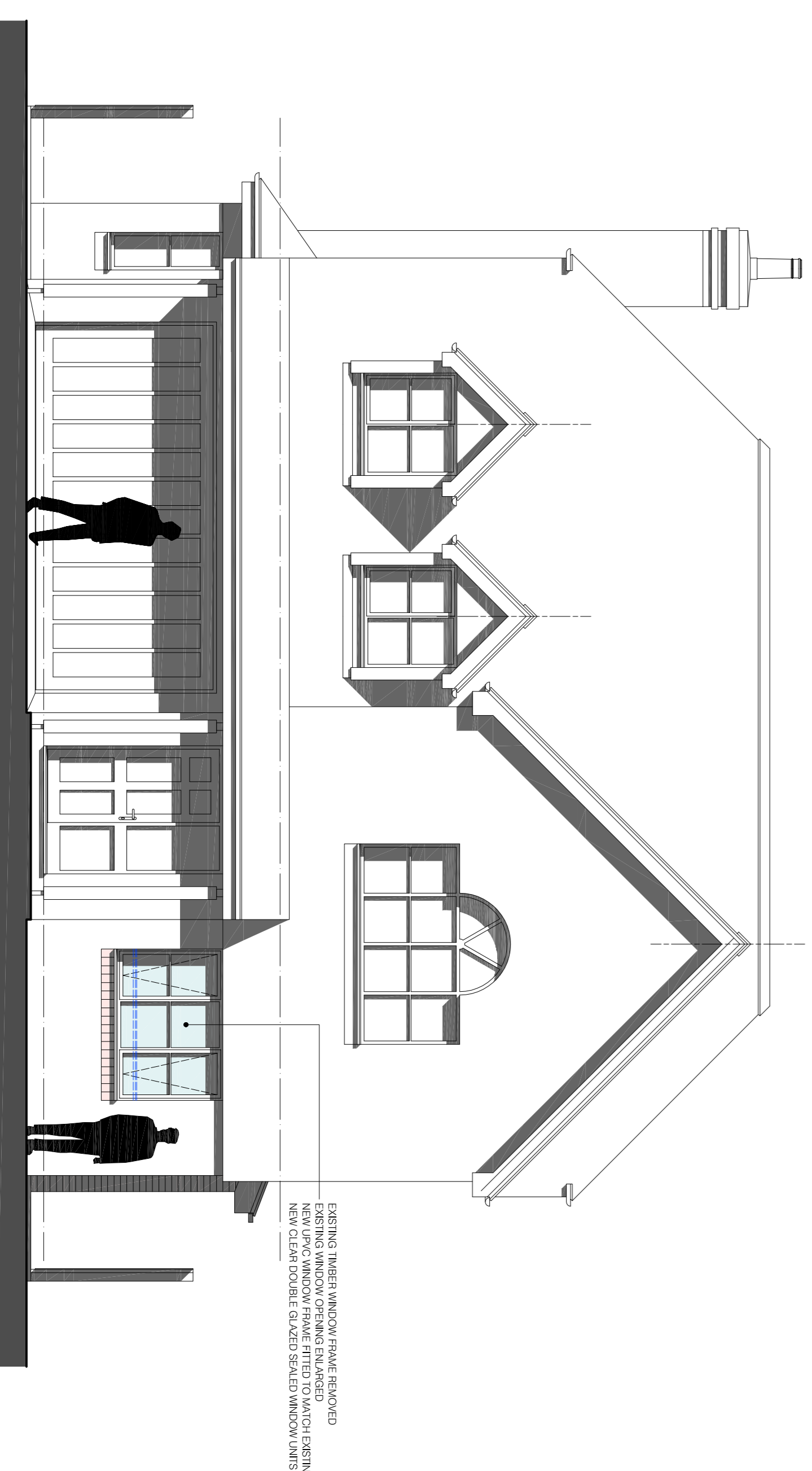
NORTH - EAST ELEVATION