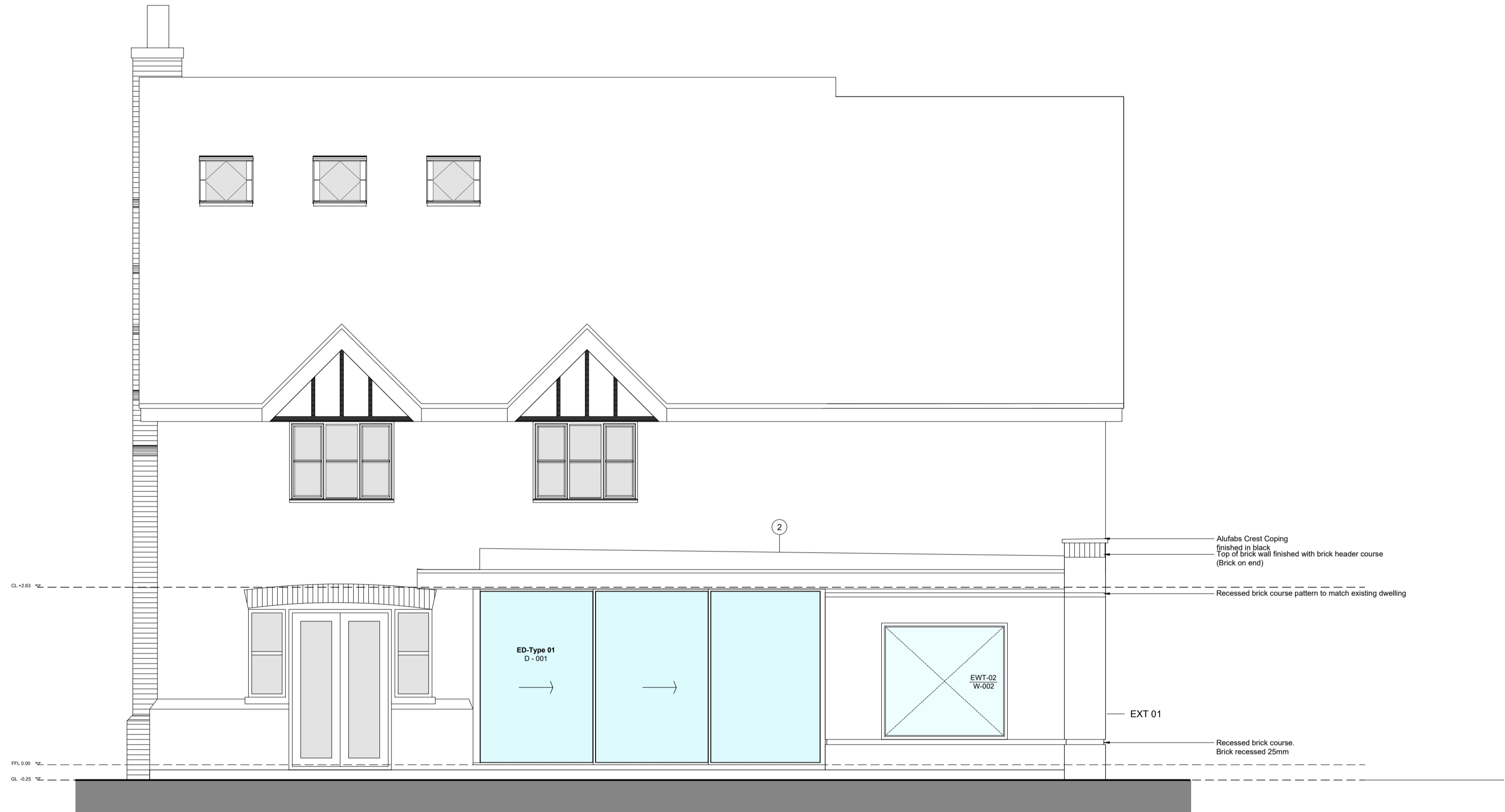
05 - Rear (South-East) Elevation (1:50)