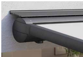
Closed full cassette system