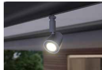
LED Spots attached to the light bar