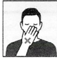
Avoid touching your face.