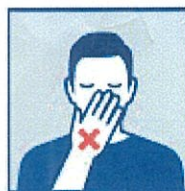
Avoid touching your face.