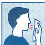
Use a tissue for coughs and sneezes.